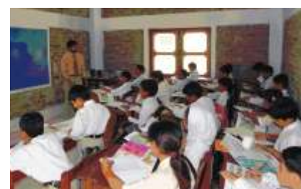
Availability of basic amenities completes a school

The classrooms now stand completed. They have enabled the enrollment of additional students, a majority of whom are girls. PEL is proud to have created a good model of mutual collaboration and prudent social investment, and intends to support capacity building in the education sector in all its concession areas in the future as well.