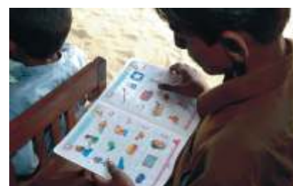
Good primary education - A sound foundation

With the Education Project, OMV (Pakistan) is progressively contributing towards human capital development in our lease areas. The intelligent design of the Project continually adds new need-based components to it, supporting communities that look forward to advancement through enlightenment.