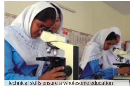
Technical skills ensure a wholesome education

Pakistan Oilfields Limited (POL) is an active and responsible member of the community in which it operates. Initiated in the early 20th century, POL's 'Community Development Practices' is a visionary program that focuses on health services, water supply schemes, and infrastructural and educational development. The program demonstrates POL's long-term association with the communities surrounding its oil fields, and its commitment to understanding and addressing local issues.