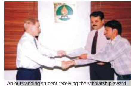
An outstanding student receiving the scholarship award

Pakistan Petroleum Limited (PPL) initiated several projects in the education sector during the years 2005-2006. These projects were undertaken with a view to improve educational opportunities at all levels and facilities for research in Pakistan. The company provided generous funds for educational projects in the areas of primary, higher, and technical education throughout the country. These